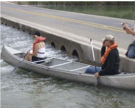
"I wonder if we can get this canoe through there?"