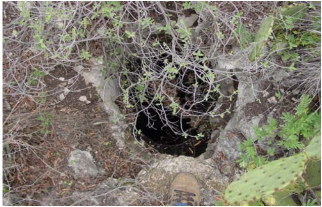
Potential caving opportunity?