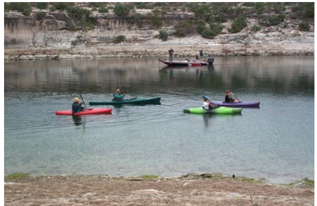
Intrepid kayakers