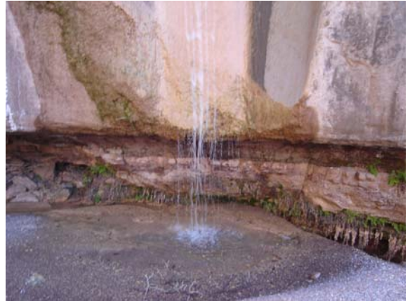
The waterfall was running as usual...as was Mule Ears Springs!