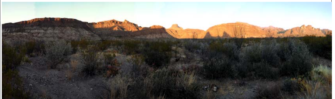
Our view from camp

"I expected times like this—but I never thought they would be so bad, so long, and so frequent."