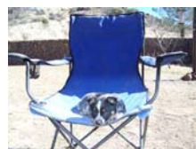
Our new editor