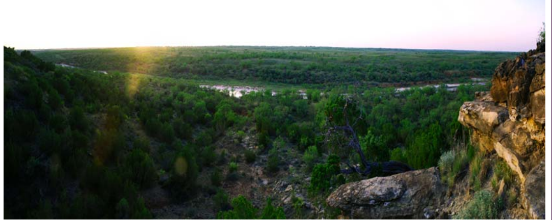
Bad panorama shot from cliffs at Barber Ranch (thanks sun...for nothing)